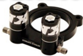
Plate System for 2.3L Ecoboost